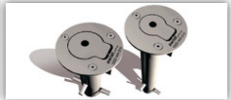
In Ground Sockets

Ausbrella is a stunning new umbrella range ideal for harsh areas, resorts, council open areas or simply around the home. With a wide range of features and benefits, all covered by patents pending, this is the umbrella of the future. Setting the highest possible standard for umbrellas and is made in Australia.