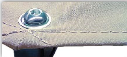
Bolt on Fabric Cover