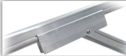
Patented Interlock Frame System