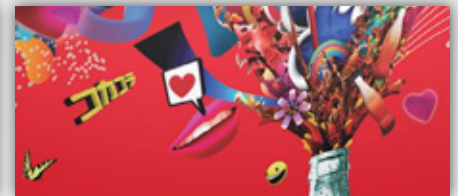
Digital or Screen Printed Branding