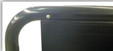
Curved Sail Track Fixing Method