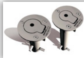
In Ground Sockets