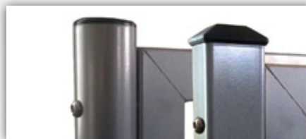
Round or Square Legs