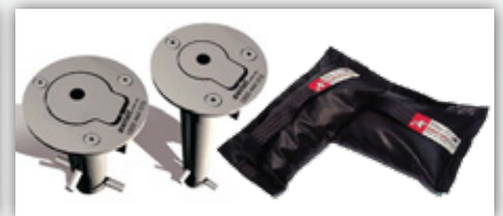
Securing Methods Available

Awnet's Style 8 fully framed aluminium cafe barrier gives customers comfort all year round where weather conditions prevail that do not allow for the standard low barriers.