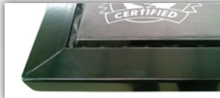
Proprietary Staple in System