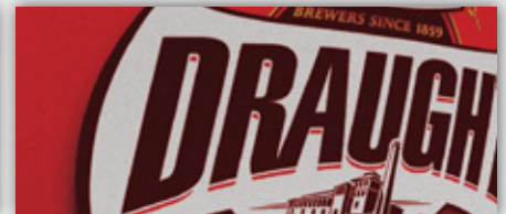
Digital or Screen Printed Branding