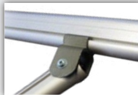
Patented Interlock Frame System