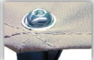
Bolt on Fabric Cover