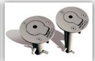
In Ground Sockets

The Cafe 2000 is Australia's first commercial market umbrella. Fully engineered and approved by Australia's Councils for use on public assets. The most universally used engineered umbrella in the hospitality and advertising industries in Australia.