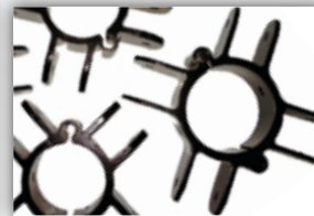
Custom Extruded Cogs